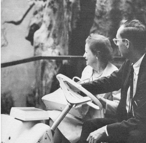
A guided tour through the World of Birds at the Bronx Zoo delights the woman who made it possible. Sloping ramps connect the building's two levels of natural settings—hillside, swamp, desert, and rain forest—where more than 100 species of birds can be seen.