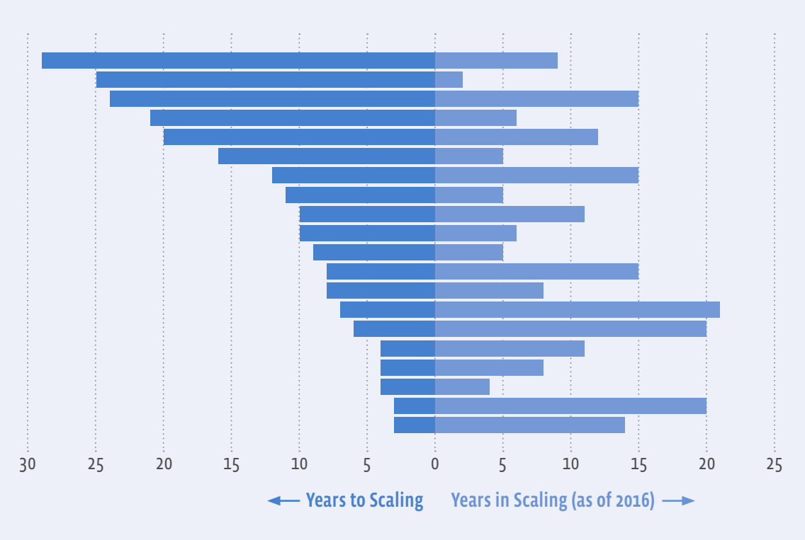
Figure 3.1. Scale Up Time Periods for 20 Affiliate Pathway Social Programs.

Across the 20 programs in affiliate pathways, the average time from program origination to the beginning of scale up was 11-12 years.