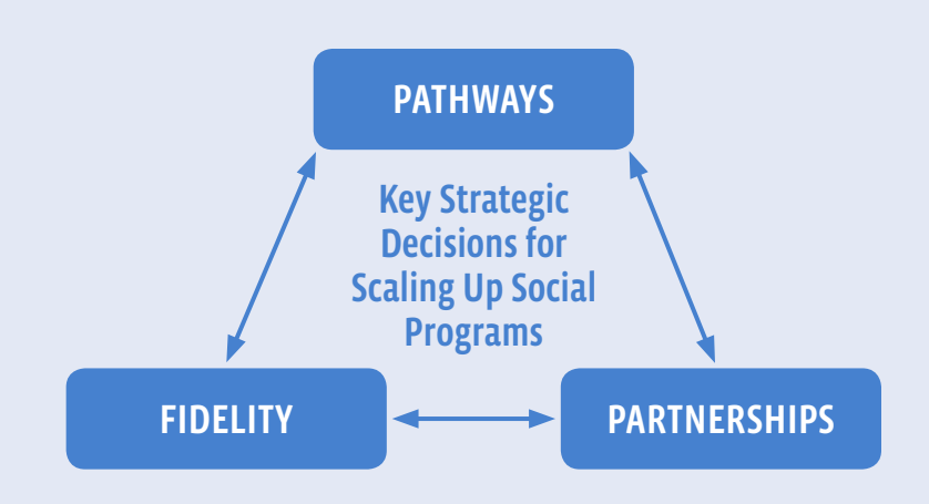
Figure 5.1. Three Strategic Choices Common to Scale Up Efforts in the 45 Examined Cases.

We set out to build on recent work about approaches for organizing the scale up of social programs. We did this through an exploratory comparative case study of 45 social programs. We focused on trying to better understand three strategic choices that were common among the scale up efforts we examined, as depicted in Figure 5.1.