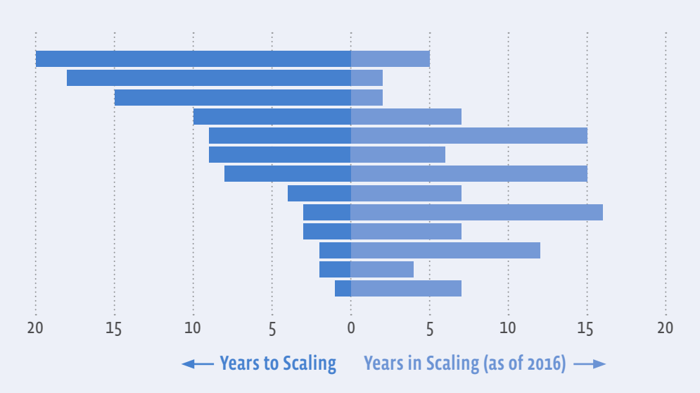
Figure 4.1. Scale Up Time Periods for 13 Distribution Network Pathway Social Programs.