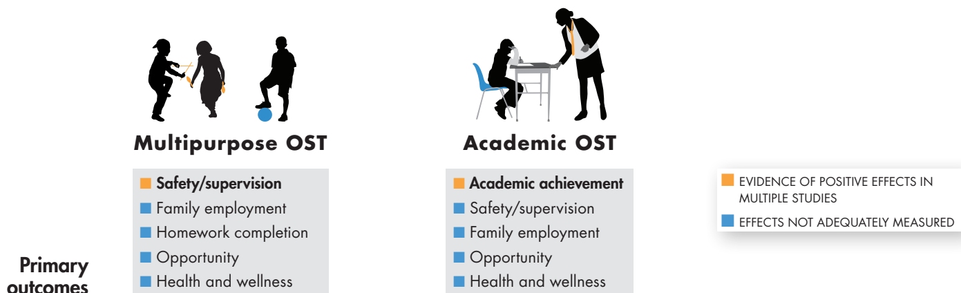
FIGURE 2 Many primary outcomes of OST programs are not adequately measured.

Findings from randomized studies of 21st CCLC programs and other multipurpose programs indicate that youth assigned to participate in the programs were more likely to be supervised by adults, and elementary school participants reported feeling safer compared with youth not assigned to these programs. 19 Increased adult supervision meant that students were less likely to be cared for by older siblings and had less time for unsupervised activities with peers out of school. 20 Adult supervision is important to youth development and promotes personal safety and not participating in risky behaviors, such as smoking.