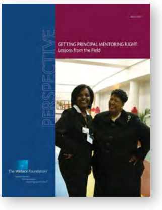
Getting Principal Mentoring Right: Lessons from the Field, A Wallace Perspective, 2007.