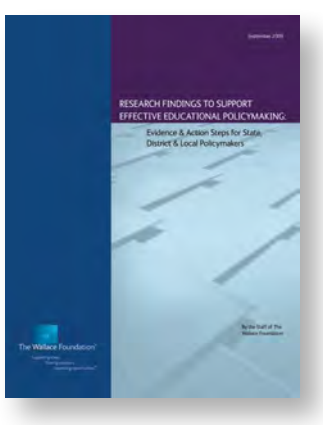
Research Findings to Support Effective Educational Policymaking: Evidence and Action Steps for State, District and Local Policymakers, The Wallace Foundation, 2011.

Good Principals Aren't Born — They're Mentored: Are We Investing Enough to Get the School Leaders We Need?, SREB, 2007.