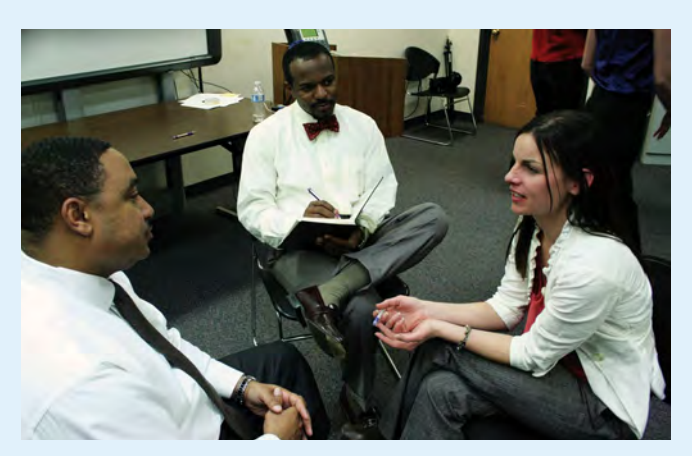
Two students in Denver's Ritchie principal training program simulate a principal-teacher conference while a classmate takes notes to give them feedback.

a commitment to research that yields the data to track graduates' on-the-job performance and identify training weaknesses.