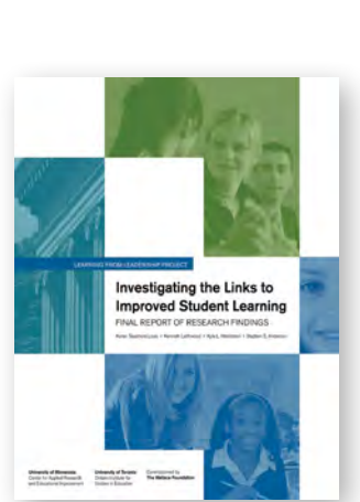
Learning From Leadership: Investigating the Links to Improved Students Learning, University of Minnesota and University of Toronto, 2010.