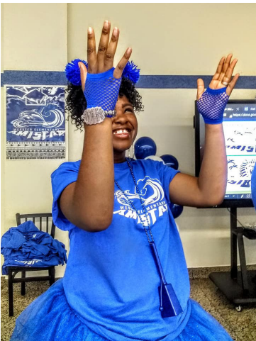
A Webster student dressed in house colors.

Support provided by the steering committee enabled staff across campus to master SEL strategies—e.g., short SEL routines, shared SEL language, and a house system—which helped embed SEL throughout Webster, potentially supporting longer-term sustainability of SEL on campus.